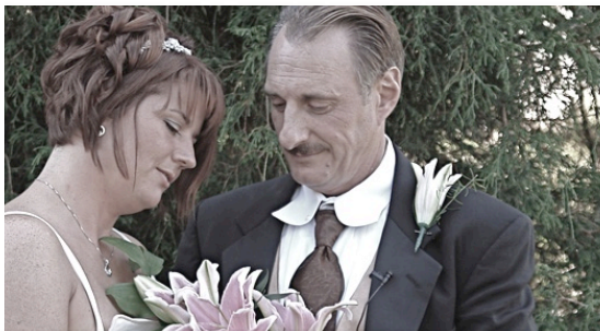
The perfect guide for the Valley Bride

THE ANNAPOLISVALLEYWEDDINGS.CA NEWSLETTER